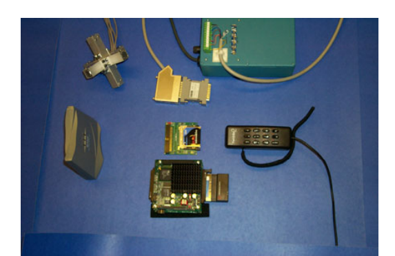
Figure 4. Components of the inertial tracker. The cross-shaped device in the upper left is the inertial tracker. The microprocessor (lower center) is worn by the user, and broadcasts tracking data offboard to the base station (lower left).

used when you only need the functionality of the core library and not of the implementation.