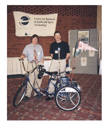
Figure 1: The Virtual Reality Tricycle. The VR Trike permits different combinations of visual and non-visual cues to be presented to an operator, but uses a HMD to generate the visual cues.

Using virtual reality to study human perception introduces its own set of problems. The virtual environment must generate cues that agree with cues normally generated if the person was actually sensing in the real world. If this is not the case, then the unintentional conflicts introduced by the virtual reality will confound the intended conflicts introduced to investigate perceptual mechanisms.