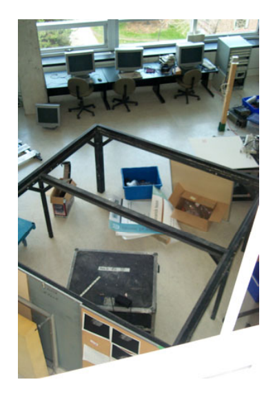
(b) View of the floor support taken from the 2<sup>nd</sup> story of the VGR lab. A catwalk around the space provides access to the projectors and mirrors. Note that IVY's floor is located 4' above the physical floor of the lab.

Physically, the floor is a sandwich of a thick (4") glass panel which provides physical support so that users can walk within IVY, a fabric projection screen, and a thin glass layer on the top to protect the projection screen. The floor is held within a steel support cradle that also provides support for the walls. The ceiling is suspended above the rest of IVY from the physical ceiling of the lab. Again, in order to reduce the physical footprint, the video signal is