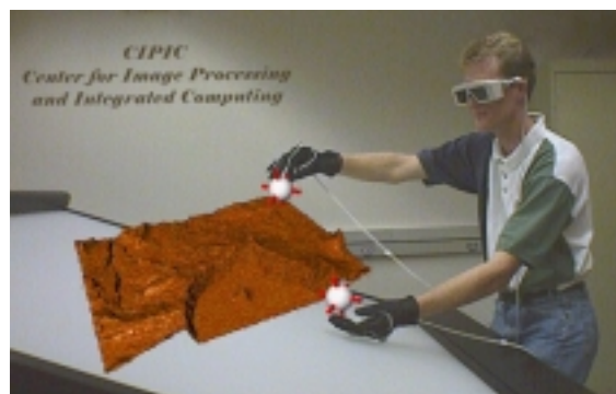
Figure 1: Terrain modeling and verification

spatially tracked gloves and can employ a head-mounted display, immersive workbench or standard monitor-based stereo to create a 3D scene (Figure 1, 2). The core design criteria was to provide technical and non-technical users with an easy-to-use environment, for the creation of realistic environments. At the same time it was important to offer an unconstrained interface to the user that reduces or removes the pre-meditative design phase. This was accomplished by providing an environment that fosters the use of built-in verification tasks and the development of “game strategies” as part of the design cycle, resulting in a thoroughly developed and tested final product. Visibility, reachability and accessibility controls are built-in features that are automatically used throughout the design cycle. Relevant viewpoints or paths can be created as required and revisited throughout the design cycle for verification tasks.