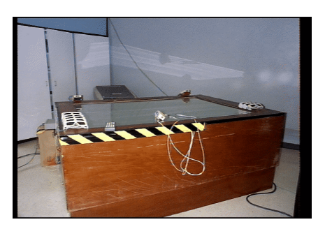
Figure 3 Workhench and Polhemus Fastrack

VrController. The main VrController is responsible to process and communicate with all the local VrControllers running at the participant site. Figure 4 shows the connection between the local VrController and all the processes at a participant site.