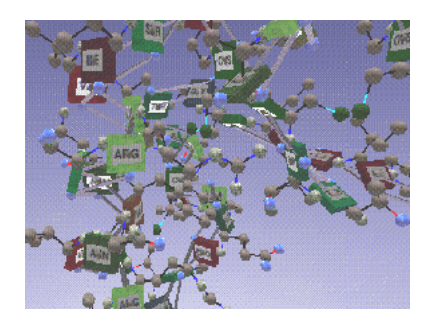
Figure 2 Iconic Representation

and private institutions have developed several practical and promising Distributed Virtual Reality applications [1][5][7][9][11][12][13][14][16][17]. Most Distributed Virtual Reality applications have some common properties. They are comprised of computer systems located at the same site or at geographically distant sites that are networked together, they use multiple processes, and they are used simultaneously by multiple people. The users interact with one another, and they are represented by an abstract representation to notify each other of their positions in the virtual environment. Un-Jae Sung et al [15] outlined some of the general characteristics of a DVE application. In general, DVE applications can be classified into large-scaled and small-scaled applications. A large-scaled DVE application may consists of several hundred nodes or participants, whereas a small-scaled DVE may consists as few as two participants within the same virtual environment.