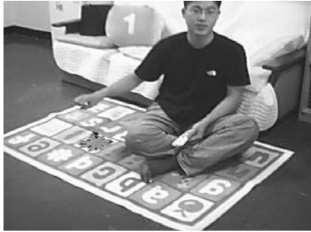
Fig. 3 A viewer is trying to touch a virtual bee. He acts as if he really touches the object.