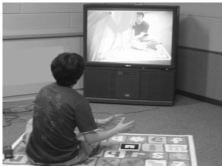
Fig. 4 Actually a virtual object is in the television not real world. A viewer is watching himself and the virtual dinosaur shown on the screen.

The 3D modeling data of the virtual objects are previously stored in the computer. We assume that the modeling data is delivered from broadcasters. For the interaction with the virtual object, MR.TV software detects the 2D position of the center of the viewer's hand. Using the difference of the color information of a hand and a background, we can gain 2D hand position. By only judging whether the viewer's hand touch the virtual object or not, if she touch the object, the object reacts as previously determined ways. It is pretty simple to implement but has the power to make viewers more fun.