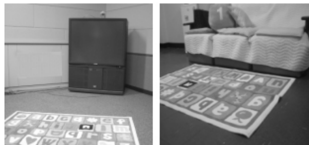
Fig. 2 A circumstance of MR.TV system

For the implementation, a television, a remote control and a carpet attaching a marker are used. Instead of a set-top box, a computer is used to implement a MR.TV software for convenience of the experiment. Instead of receiving broadcast data we used 'avi' files stored in the computer. The MR.TV software, substituted for MR module in the set-top box, mixed and controlled properly inputs from files and the webcam. The software was programmed using VC++ and ARToolkit and run on a 2.4GHz Pentium 4 PC. For the convenience of tracking, MR.TV uses ARToolkit which is based on a marker. In the future, ARToolkit can be replaced with tracking technology that does not need specific markers so it can be hidden in our living environment. We use an 'iBOT 1394' web-camera.