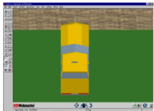
Fig.4 Force Feedback