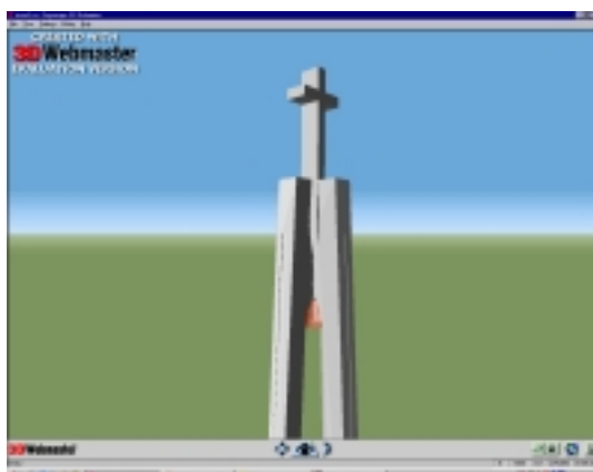
Fig.3 Audio Sound