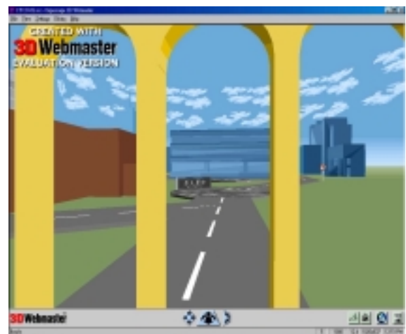
Fig.2 Visual Sign