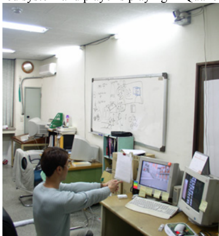
Fig. 5. Implemented Interface.

To applied to game, we use Quake II DLL ( http://www.quake2.com/dll/ ) that is presented Dynamic Linked Library by Id Software® for the purpose to enhance ability of Quake II's game components. In the applied system, the interface has processing ability of 15 frames per seconds (fps). Although the definition of 'real-time' is not clear [6], we call our interface as the real-time interface since our interface can process present frame until arriving next frame. Fig. 5 shows the applied system and player's playing in Quake II.