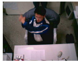
(a) the last frame of given an image sequence

We use S(x, y, t) as an image has skin color regions so that make H_{\tau}(x, y, t) as shown in Fig. 2 where \tau = 15 .